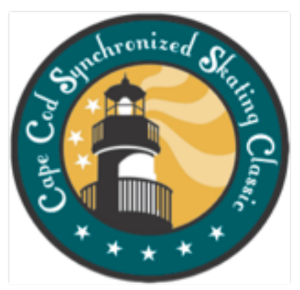
The 23rd Annual Cape Cod Synchronized Skating Classic Hosted by: The Bourne Skating Club December 9-10, 2017

The 23rd Annual Cape Cod Synchronized Skating Classic will be conducted in accordance with the rules and regulations of U.S. Figure Skating, as set forth in the current Rulebook as well as any pertinent updates posted on the U.S. Figure Skating web site.